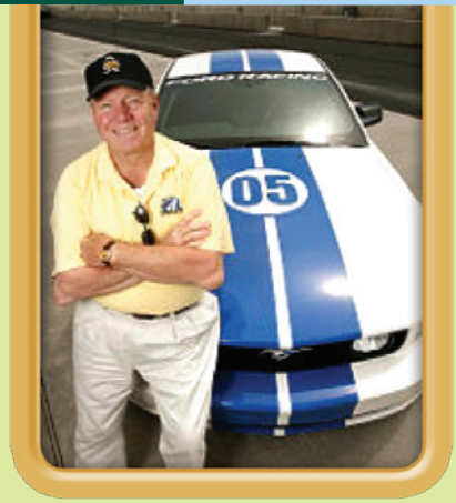
Larry H. Miller leans on a Ford Mustang used in his race-car-driving school.

Finally, in a bid to make the attention-getting prize package even more enticing, along with the car, which was specifically built for the Miller Motorsports Park